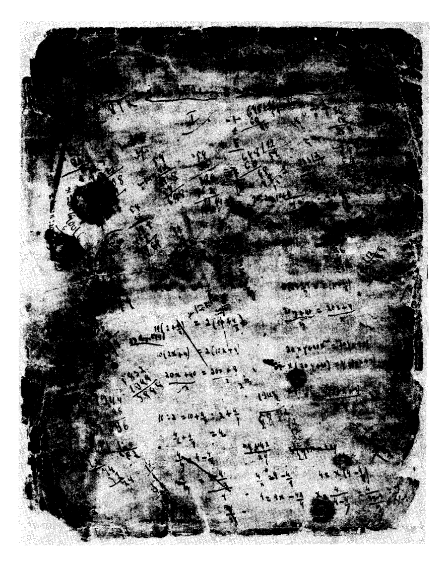
Cover page of Notebook I of the Economic Manuscript of 1861-63