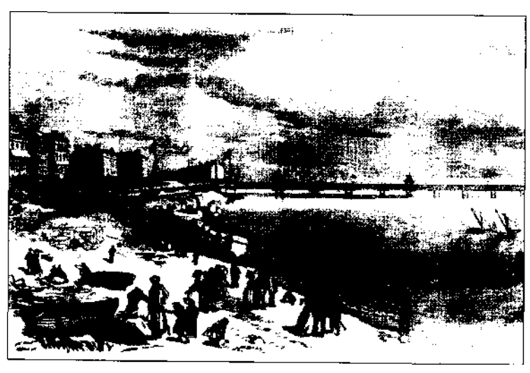
The seaside at Eastbourne