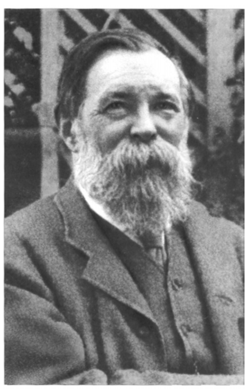
Frederick Engels, 1893